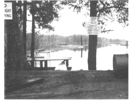
The Public Beach at Shawnigan Lake (Mason's Beach)

- Visit our community memory tent. Gather to trade stories and talk about the community's past.